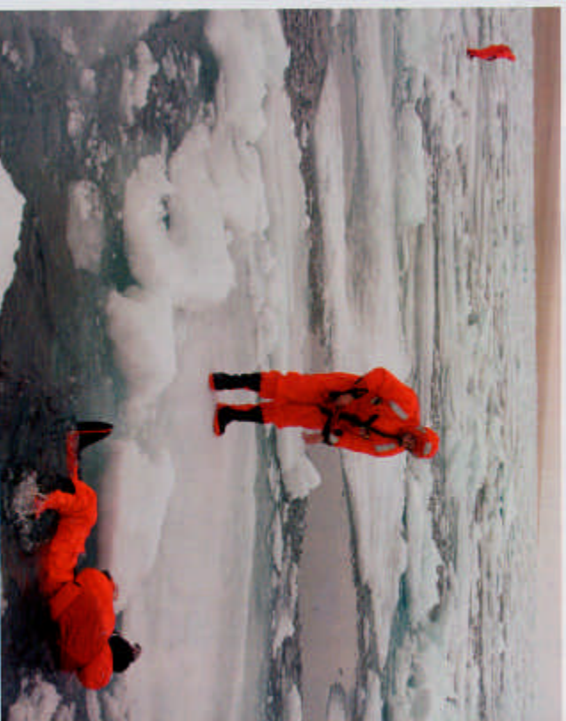
The team borrowed immersion suits from the marooned French yacht, Vagabond

The Canadian Coastguards don't encourage yachts to transit the Northwest Passage, and need convincing that both the boats and their crews are