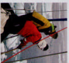
Pushing small icebergs out of the way with a posthole.