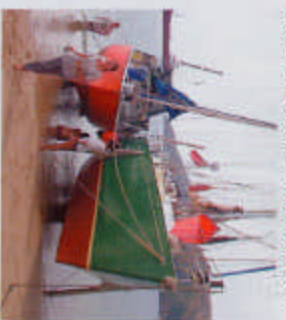
Lean on me, Norwegian Blue on a beach near the Panama Canal. You can see her multi-chine hull with the protruding keel box