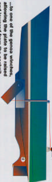
...to one of the genoa winches, allowing the plate to be raised and lowered from the cockpit