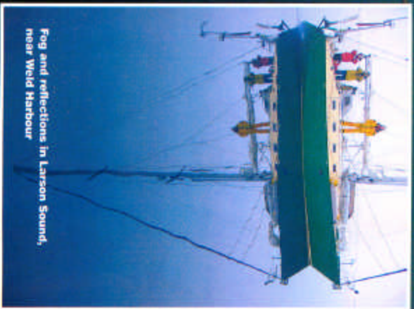
Fog and reflections in Larson Sound, near Weld Harbour