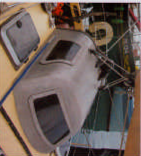
The companionway is covered by an aluminium doghouse. Note the two hatches either side to vent the steel hull in hot weather