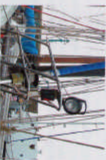
A quartz-halogen spotlight mounted on the pulpit was invaluable for spotting growlers in poor visibility