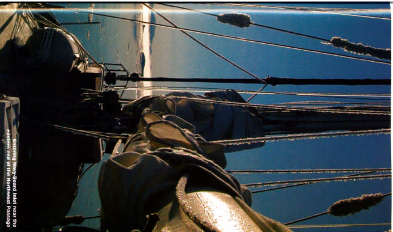
Entering Thyri-Board Inlet near the eastern end of the Northwest Passage

The Northwest Passage is a hostile stretch of water. It consists of a complex system of waterways across the very top of the North American continent, linking the Pacific to the Atlantic. Because of its high latitude, the route is totally frozen for most of the year, but for a short time during the Arctic summer, the pack ice retreats just enough to open a navigable channel. But even then, there is no guarantee of success. The ice can suddenly move back again, entombing the unway – or unlucky – until the following summer. Over the years, there have been many attempts to navigate this route, and so far only 20 yachts have ever completed it. Of those, more than half have needed the assistance of an icebreaker.