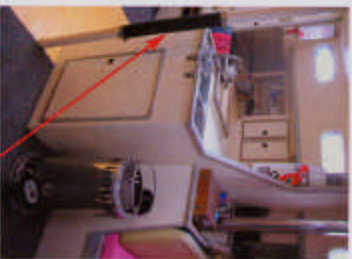
The rope for the retractable centerplate rises to the deck via a tube in the saloon. The tube has a removable rubber section for easy disassembly